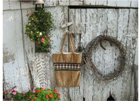
Tote bag from August workshop