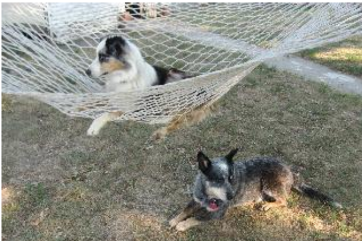
Lazy Daze of Summer