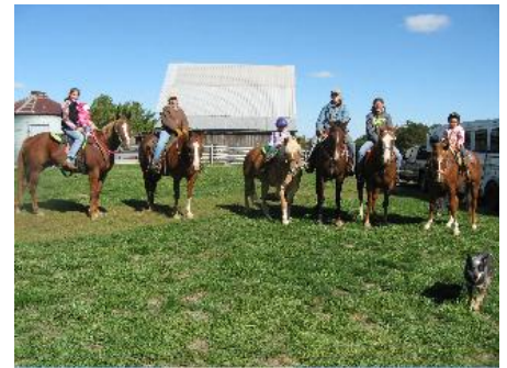
Fun ride with a daughter, 2 of my granddaughters and 3 of my great granddaughters.