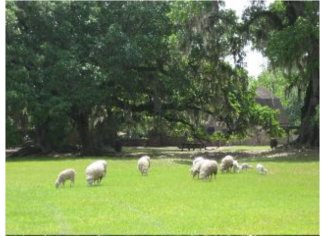
Went to Charleston, NC, last week. Beautiful oak trees, Middleton Plantation