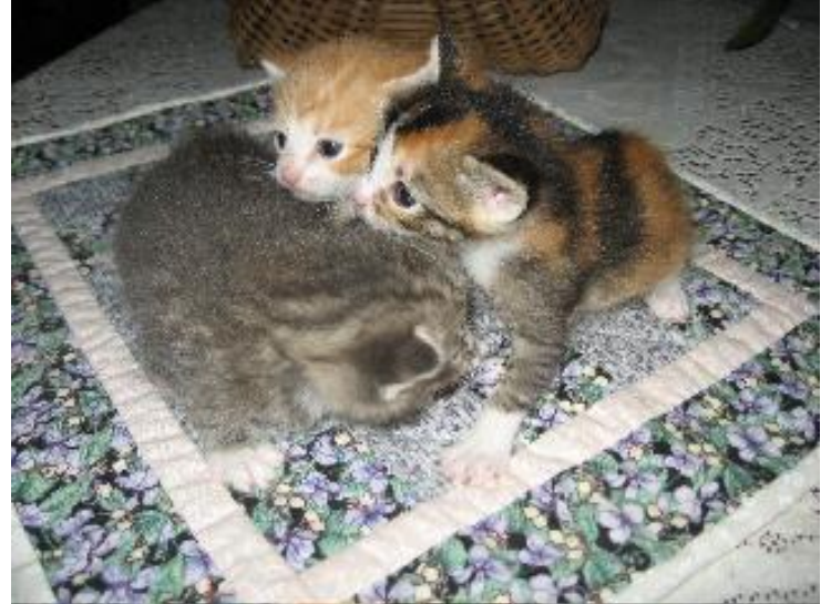
Chicks and kittens. It must be spring.